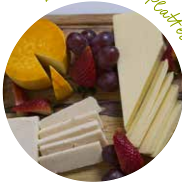
Local Cheese Platter

Oka, Rondoux, Extra Pur Chevre, Chamfleury, 3year Old Cheddar.