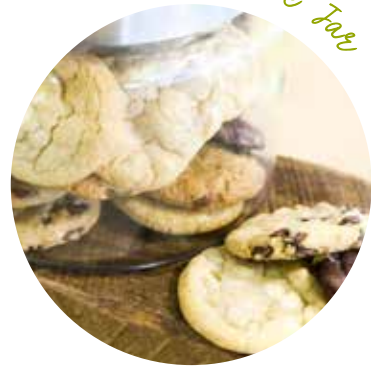
Mini Cookie Jar